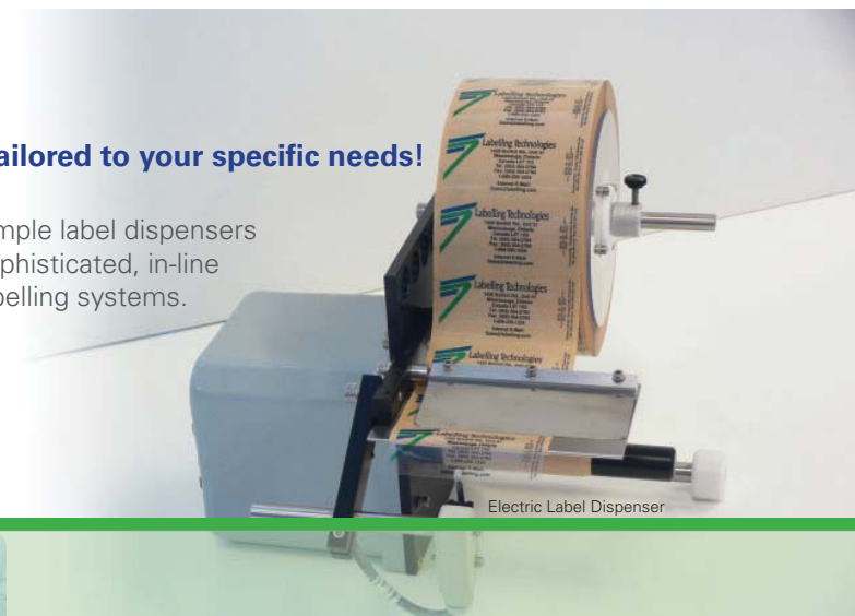
Electric Label Dispenser